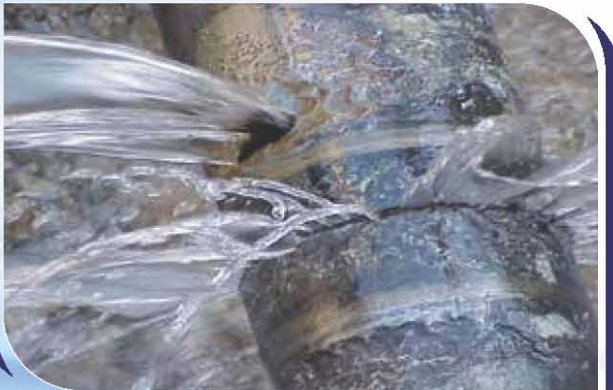
Report Burst and Leakages