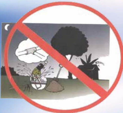
Report Illegal Connections